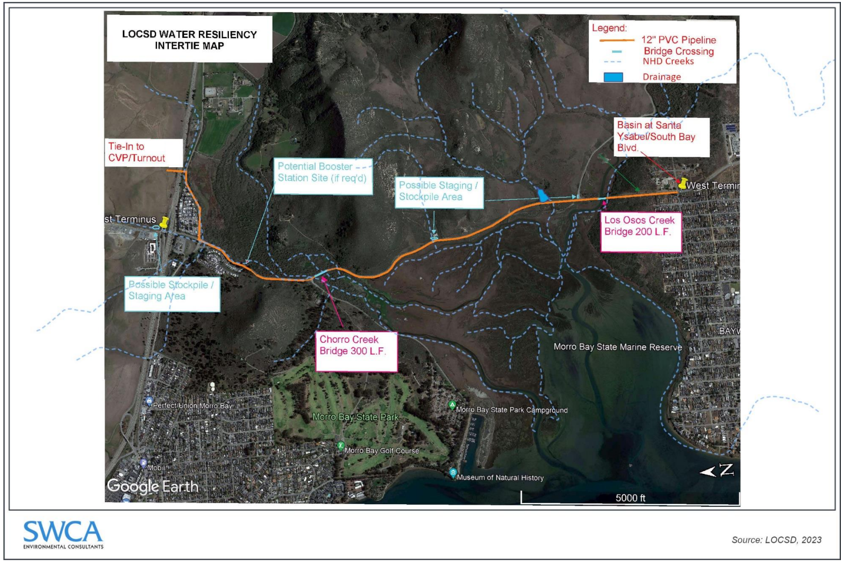
Figure 2. Project site plan.