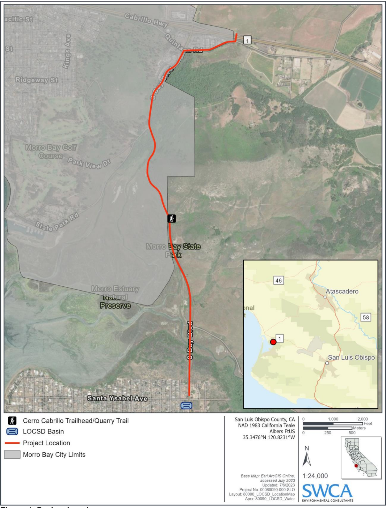
Figure 1. Project location map.