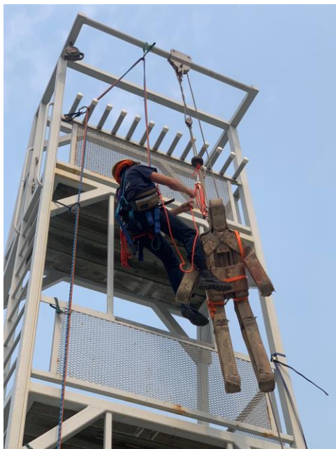
Rope training with Reserve Firefighters