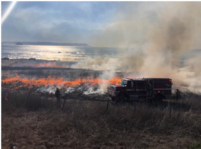
Controlled Burn at Montana De Oro