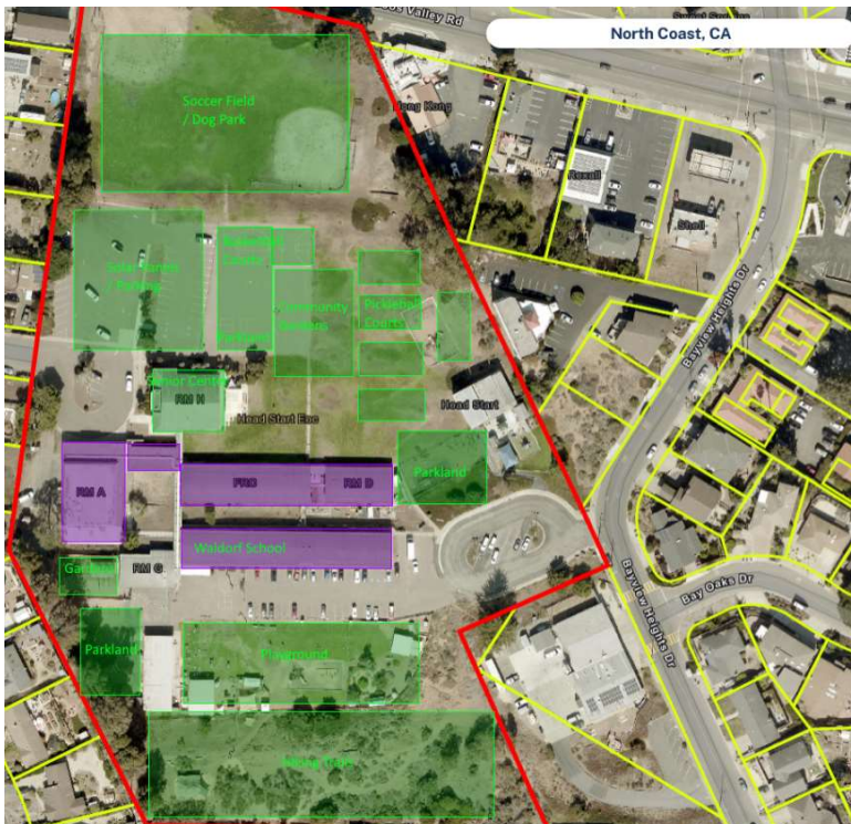
Figure 1 - Waldorf School Diagram

In order to facilitate discussions on the acquisition, Wallace Group understands the CSD would like assistance with pulling together a community townhall meeting which is likely to occur towards the end of March. The intent of the meeting is to explore the arrangement and costs of the various program activities shared previously. We understand that the Waldorf School (who is currently occupying some of the buildings) has provided a rudimentary map of the site with some of these items included (see figure 1 below).