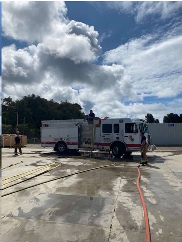
Ladder & Rescue training